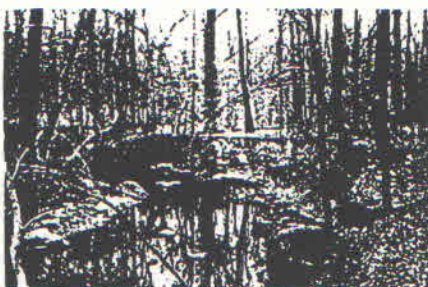
Naamans Creek (Marsh Road Area)

From I-95 N, exit at Harvey Rd, left at the light at second traffic signal (Harvey and Orleans Rds), bear left at fork onto The Highway. Continue past the Gild Hall on left to Buzz Ware Center on the right. Parking is available in front of the Buzz Ware and in the Gild Hall Lot. From I-95 S, exit onto 495 then Naamans Rd right onto Naamans, left at Marsh Rd, left onto Harvey Rd, right onto Orleans, past Gild Hall to Buzz Ware Center.